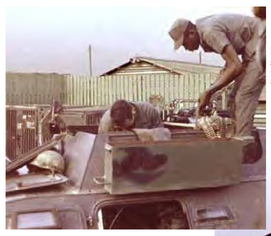
22. – Not a great shot, but close examination shows these SPs preparing a minigun for night duty. Woe to Charley if he encounters this team tonight.