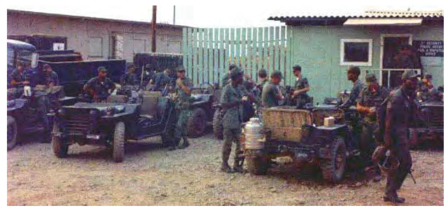
13. Security Police SAT teams prepare for deployment.