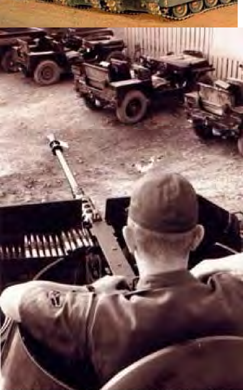
Gelderman, from Pensylvania, mans the .50 cal.

16. - Later, Lt Col. Fowle ordered our LE troops to "beat senseless" any troops apprehended from the 11th Armored Cav.