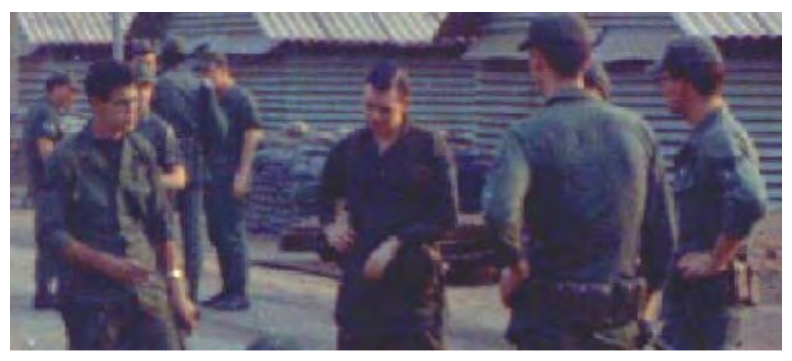
12. Now listen guys ... this is no BS and God's truth . . . Uncle Ho's gonna fly in and surrender'in to me at 2200 hours tonight ... only ... don't tell no body you heard it from me!