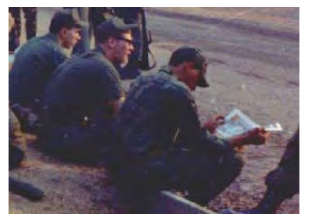
11. Hey! Stars and Stripes says there's light at the end of the tunnel.