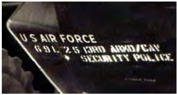
28. 3rd ACAV f the 3rd SPS