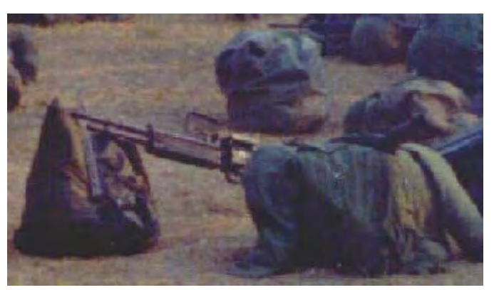
10. Heavy (literally) weapons rest on foul-weather gear bags.