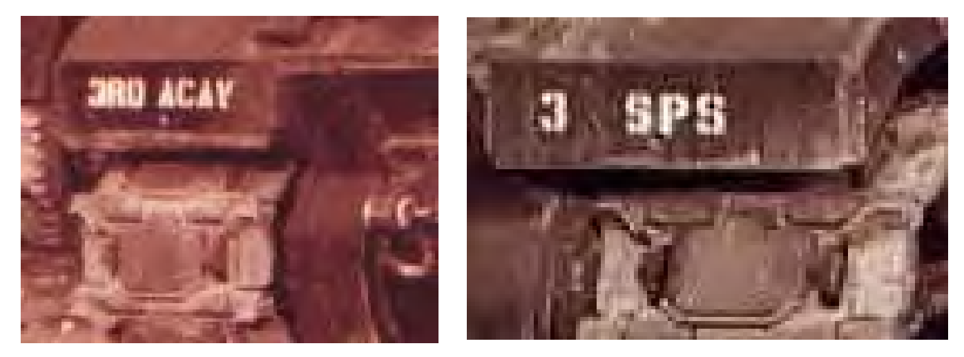
20. & 21. 3rd ACAV of the 3rd SPS