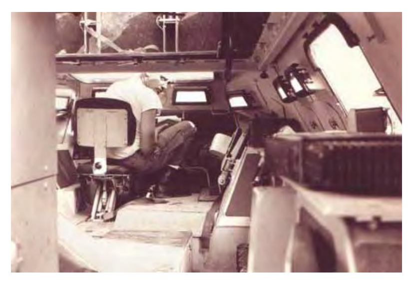
25. – Inside a "commando car." Note the knobs and ports through which SPs could fire their M16s. Anyone remember this man's name?