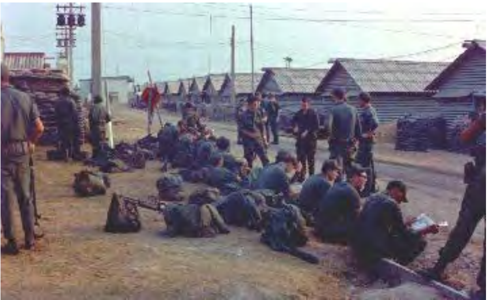
2. 3rd Security Police watching as newly arrived troops who have just deplanned. Scrathing his head in wonder at the shiny new equipment they carry.

3. Daily events, as 3rd Security Police gathering early for Guardmount.