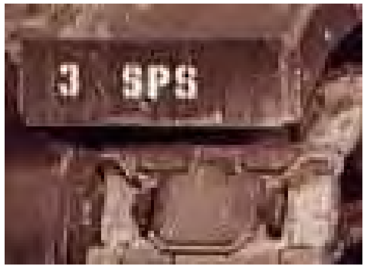
3rd ACAV of the 3rd SPS