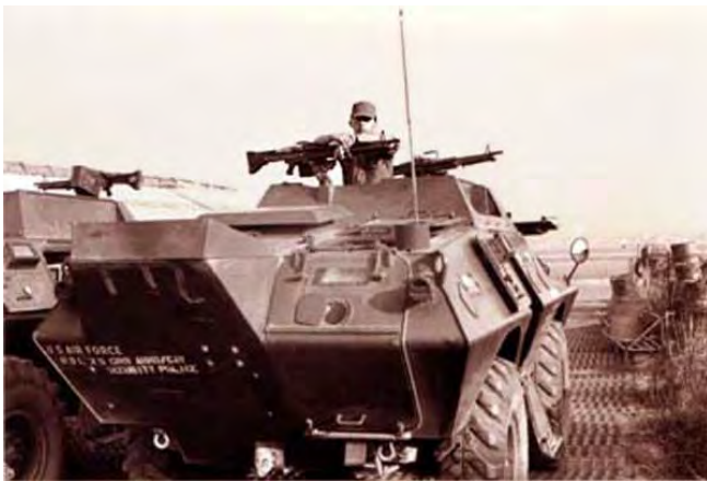
5 - G. Ernest Govea, behind an M60 machine gun on a commando car of the 3rd ACAV of the 3rd SPS.