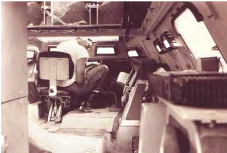
4 - Inside a "commando car." Note the knobs and ports through which SPs could fire their M16s. Anyone remember this man's name?