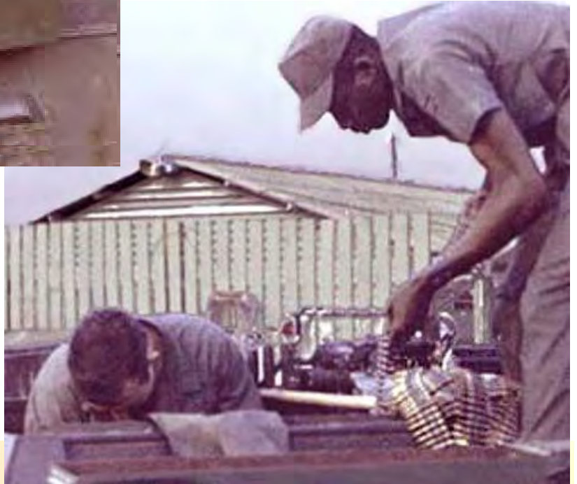
Our miniguns were slowed down to fire 3,200 full metal jacket rounds per minute.