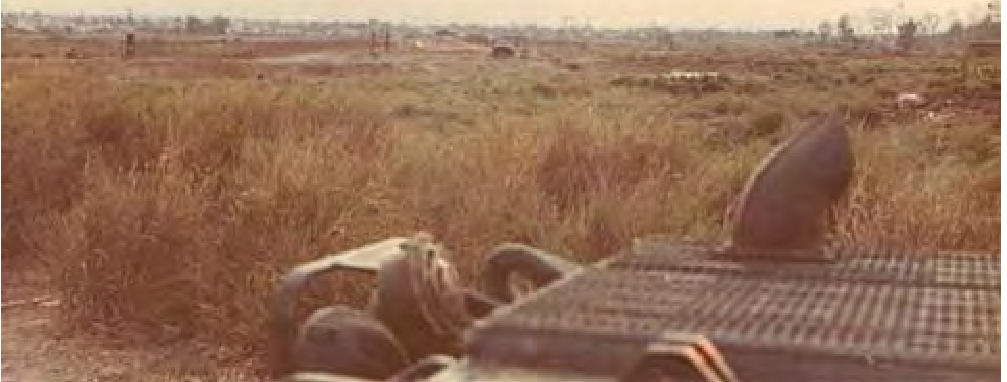
3 - I took this from the driver's seat of "Fluffy" our beloved Armored Personnel Carrier, M113. This is the North West perimeter area.