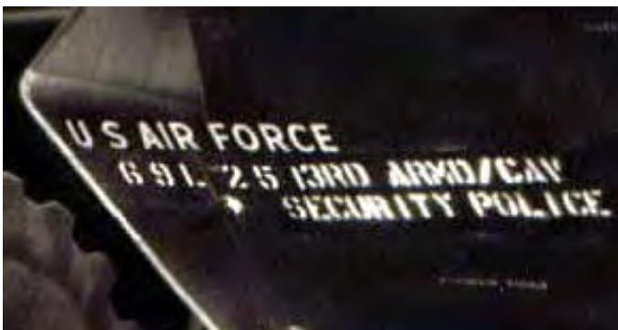
3rd ACAV of the 3rd SPS