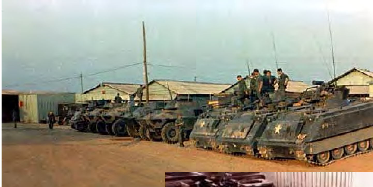
Photo-8 (above) - The three APCs on the right were among the elements of the 11th Armored Cav brought in to support the 3rd SPS in preparation for the Tet Offensive of 1969. There was also at least one tank, not shown here. During the lengthy rocket attack of the night of February 23rd, the tank crew members disobeyed orders from Lt. Col. Fowle, our squadron commander, and fired their big into the town of Bien Hoa. gun

Photo-9 (right) - Lt Col. Fowle ordered our LE troops to "beat senseless" any troops apprehended from the 11th Armored Cav. Here, US Army and SPs (in camouflage) mingle with 11thArmored Cav troops. So far as I know, that order was never carried out.