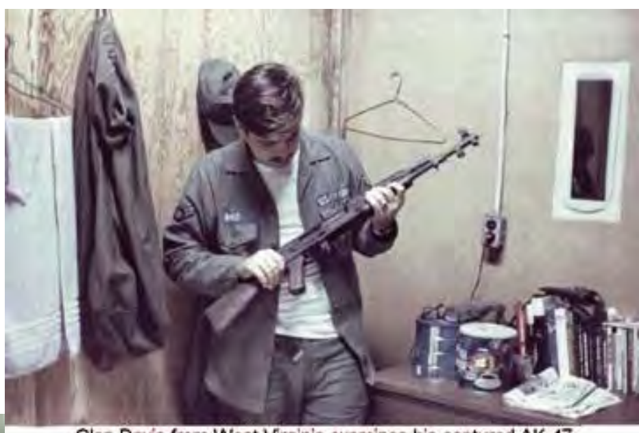
"Ain't it purtty!"