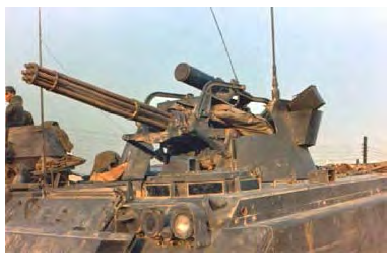
10- US Army firepower from these Vulcans was awe some.