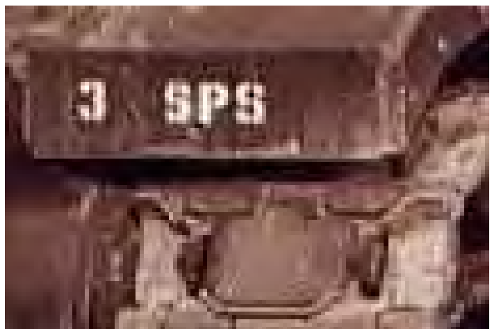
3rd ACAV of the 3rd SPS