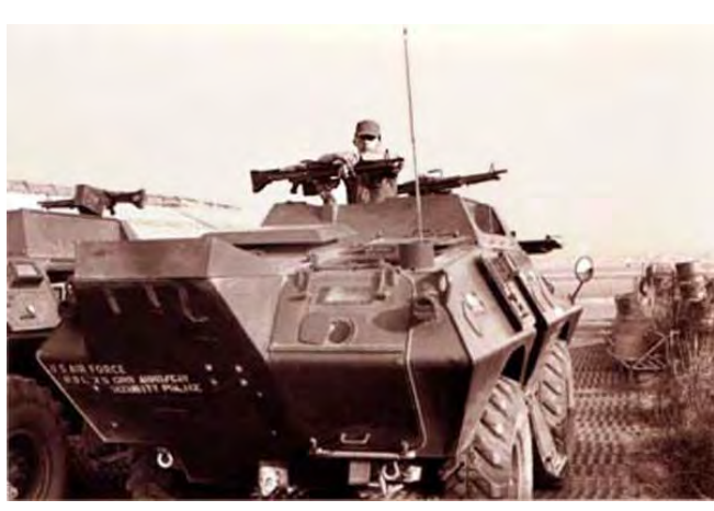
5 - G. Ernest Govea, behind an M60 machine gun on a commando car of the 3rd ACAV of the 3rd SPS.