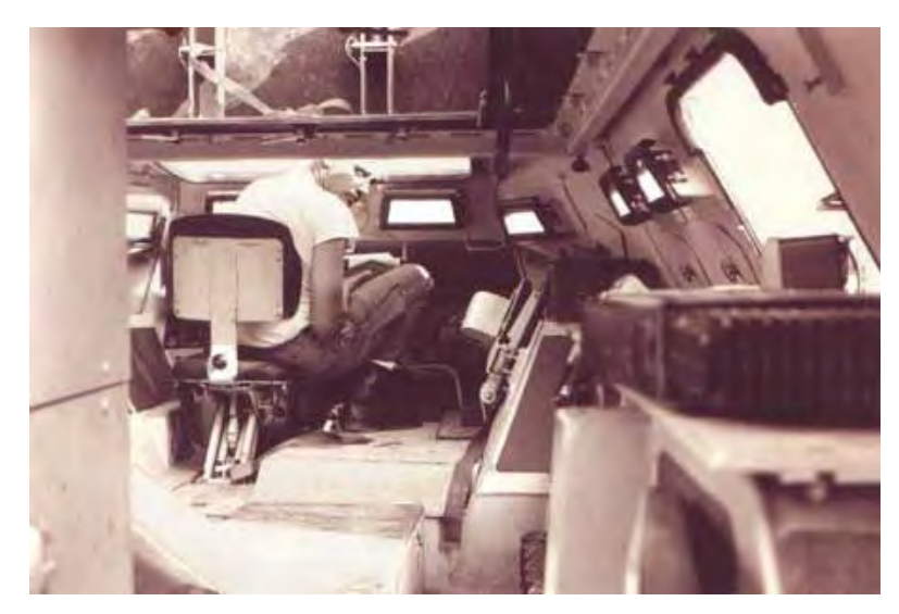
4 – Inside a "commando car." Note the knobs and ports through which SPs could fire their M16s. Anyone remember this man's name?