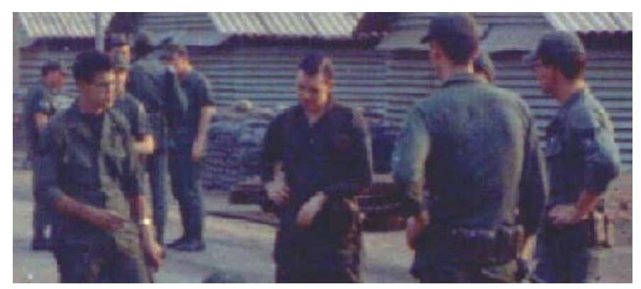
(6) Now listen guys ... this is no BS and God's truth . . . Uncle Ho's gonna fly in and surrender'in to me at 2200 hours tonight ... only ... don't tell no body you heard it from me!