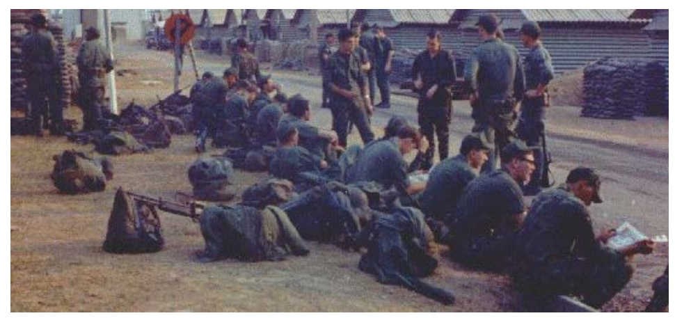
(3) Daily event, as 3rd Security Police assemble for Guardmount.