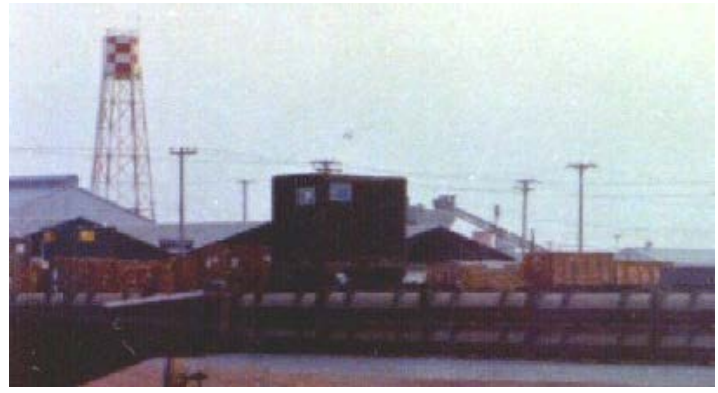
(12) Water Tower visible from most of Bien Hoa AB, and promonent from the SPS Compound.