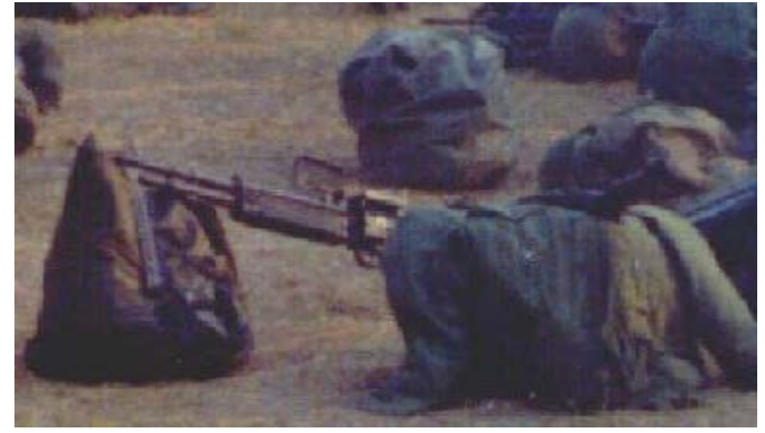
(4) Heavy (literally) weapons rest on foul-weather gear bags.