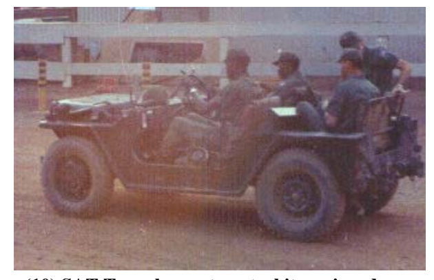
(10) SAT Team leaves to patrol its assigned area. Note the Vietnamese Q.C. riding shotgun.