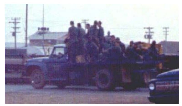
(9) Watch the potholes, Sarge!