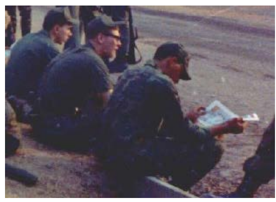
(5) Hey! Stars and Stripes says there's light at the end of the tunnel.