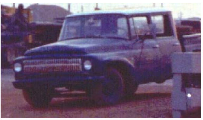
(11) SAT pickup truck on standby.