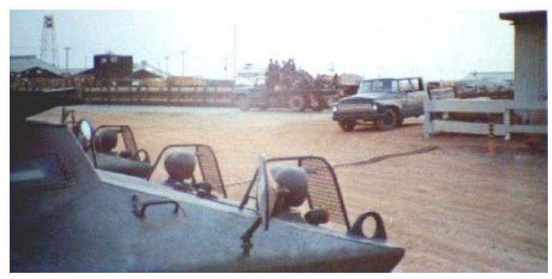
(8) A Security Police truck transports Security Policemen to be posted in Bravo or Abel areas.