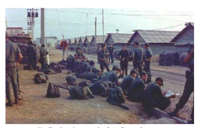
(2) Gathering early for Guardmount.

(1) 3rd Security Police watching newly arrived troops who have just deplanned. Scratching his head in wonder at the shiney new equipment they carry.