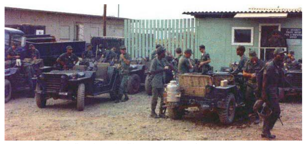
(7) Security Police SAT teams prepare for deployment.