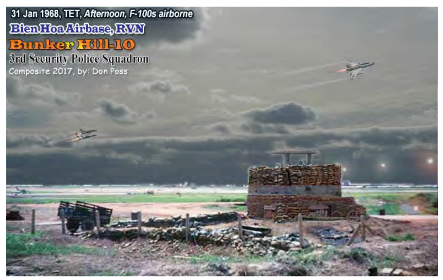
Bien Hoa AB: F-100 Super Sabres take flight.

We got into a jeep and headed out. Choppers were also clobbering the water tower located just outside the main gate. There had been an enemy spotter in that tower. He likely didn't survive.