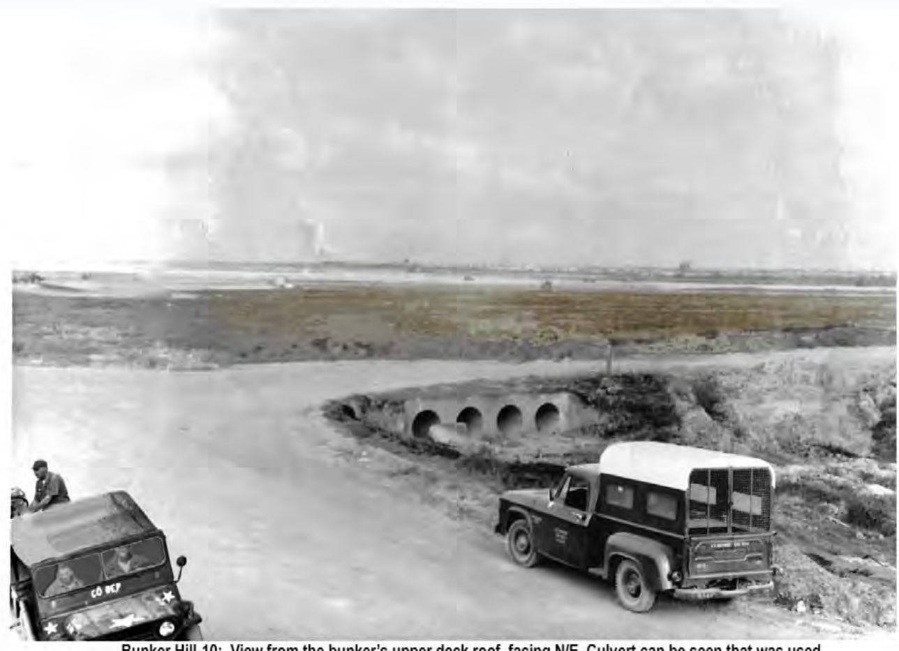
Bunker Hill-10: View from the bunker's upper deck roof, facing N/E. Culvert can be seen that was used by NVA and VC to cross under the road. Bomb strikes against enemy positions, by F-100 Super Sabres airborne from Bien Hoa Air Base, can be seen. US Army troops arrived after day light and drove the NVA and VC back in to the jungle. View is N/E from bunker's roof.