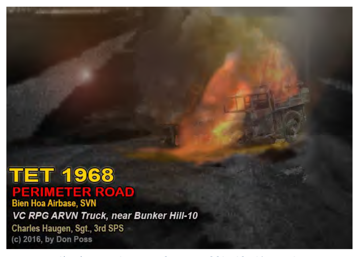
Biên Hòa AB, Perimeter Road, ARVN truck hit with VC/NVA RPG.

As the ARVN truck got closer an RPG hit it head-on lifting it into the air and dropping it like a stone on the road. Surprisingly, all of the ARVN soldiers in the truck were okay.