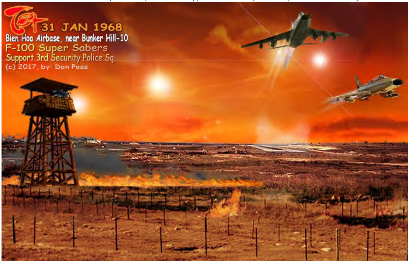
Above and Below Photo: Biên Hòa AB, F-100 Super Sabre Revetments.

Below Photo: Biên Hòa AB, F-100 Super Sabres support 3rd Security Police Squadron air base defense.