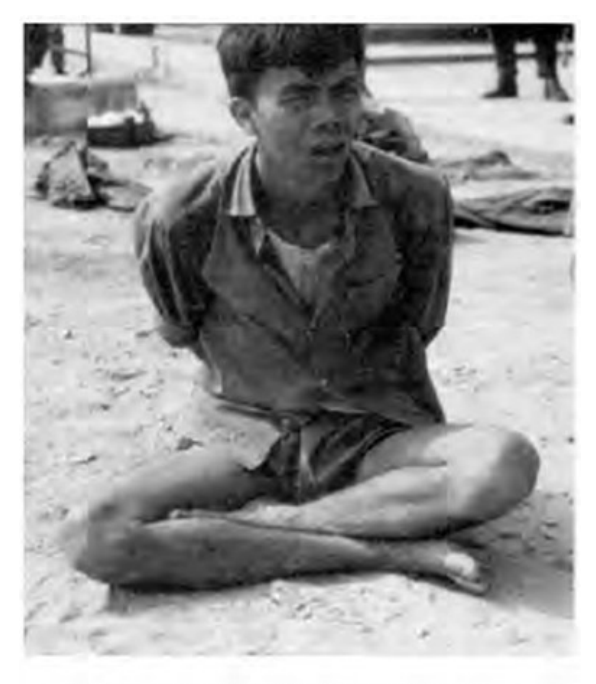
VC/NVA prisoner taken during the 1968 Tet attack on Bien Hoa Air Base (above).

"Upon arrival, they immediately cut through the perimeter fences and attacked the base. The main attacks at both bases were supplemented by secondary ones ... [from] base camps. They were held in assembly areas 9 to 12 hours marching distance from their targets until time for the coordinated assault..."