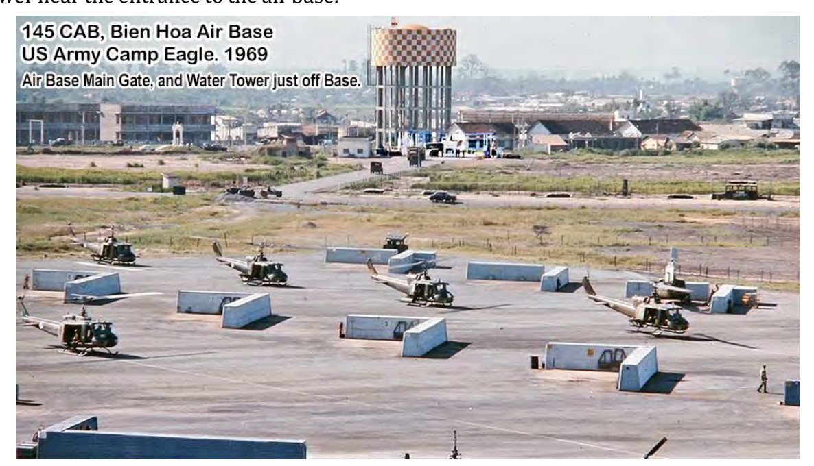
145th CAB, Camp Eagle, 1969. Main Gate & Water Tower, center top, where Sniper shootout took place the early morning of 31 JAN 1968.

Water-Tower: All night long personnel had received sporadic small arms fire from the water tower near the entrance to the air base.