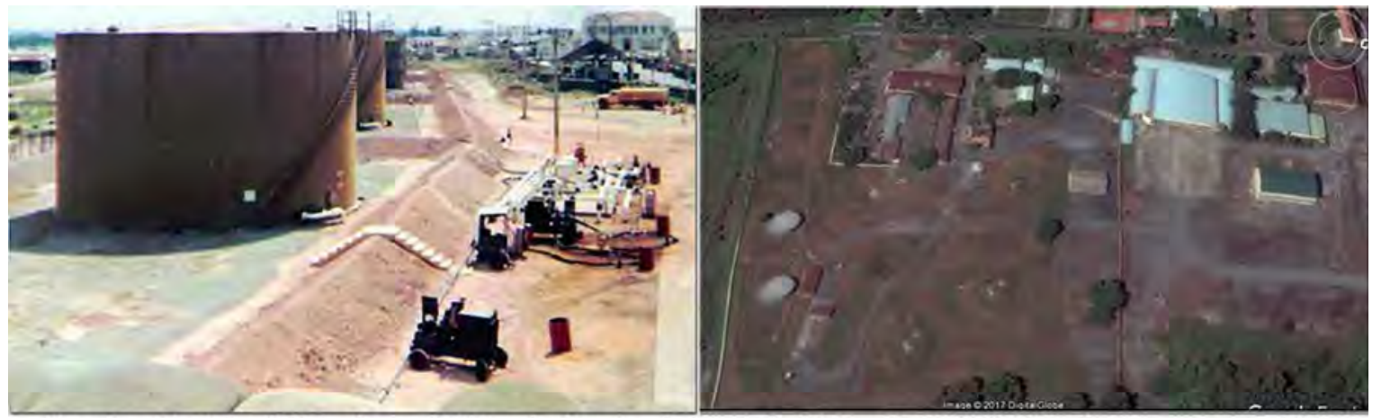
Bien Hoa Air Base, POL tanks, and POL refueling truck (top/rt). 31 Jan 1968, TET, 45 rockets were received on base. A POL refueling truck, parked about where the truck is, received shrapnel punchures, and gushed JP4 gas on to ground, which flood down side road toward a burning F-100 Super Sabre, hit by a rocket.

Photo left by David Worthen, 3rd SPS, 1969.