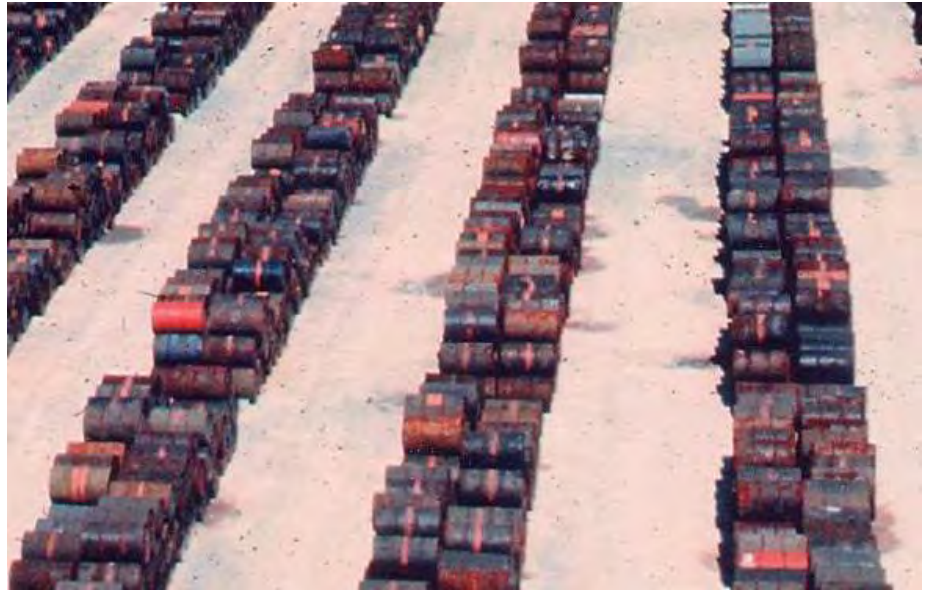
Note the photo left, where the sand is discolored by leaking barrels.

Disposal of the chemical was by incineration. Note the large cloud drifting across the base. Is it possible everyone on base could have inhaled such contamination during their service at the island?