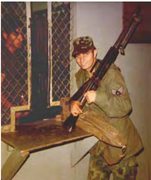
3. Midnight Shift , drawing weapons.