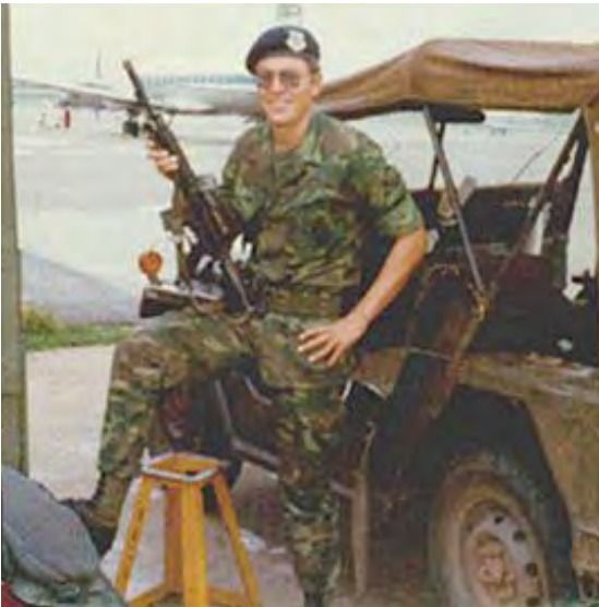
4. (above) & (5. below) I think this was Post-27, the PIG Weapons Locker: Miniguns, M60's...