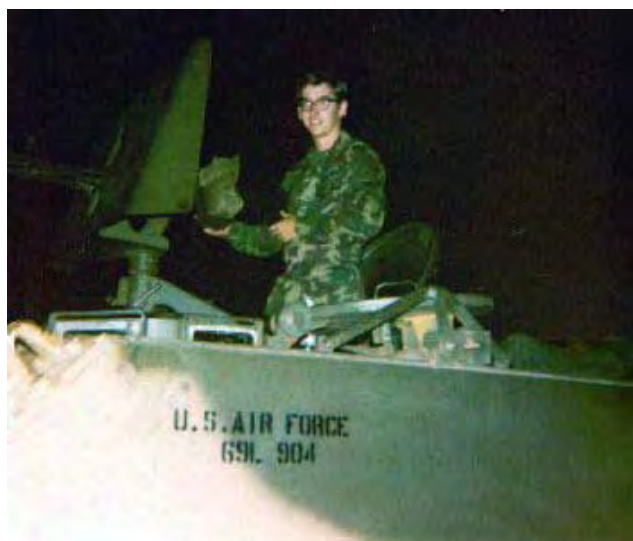
28. 904's .50 cal... locked and loaded!