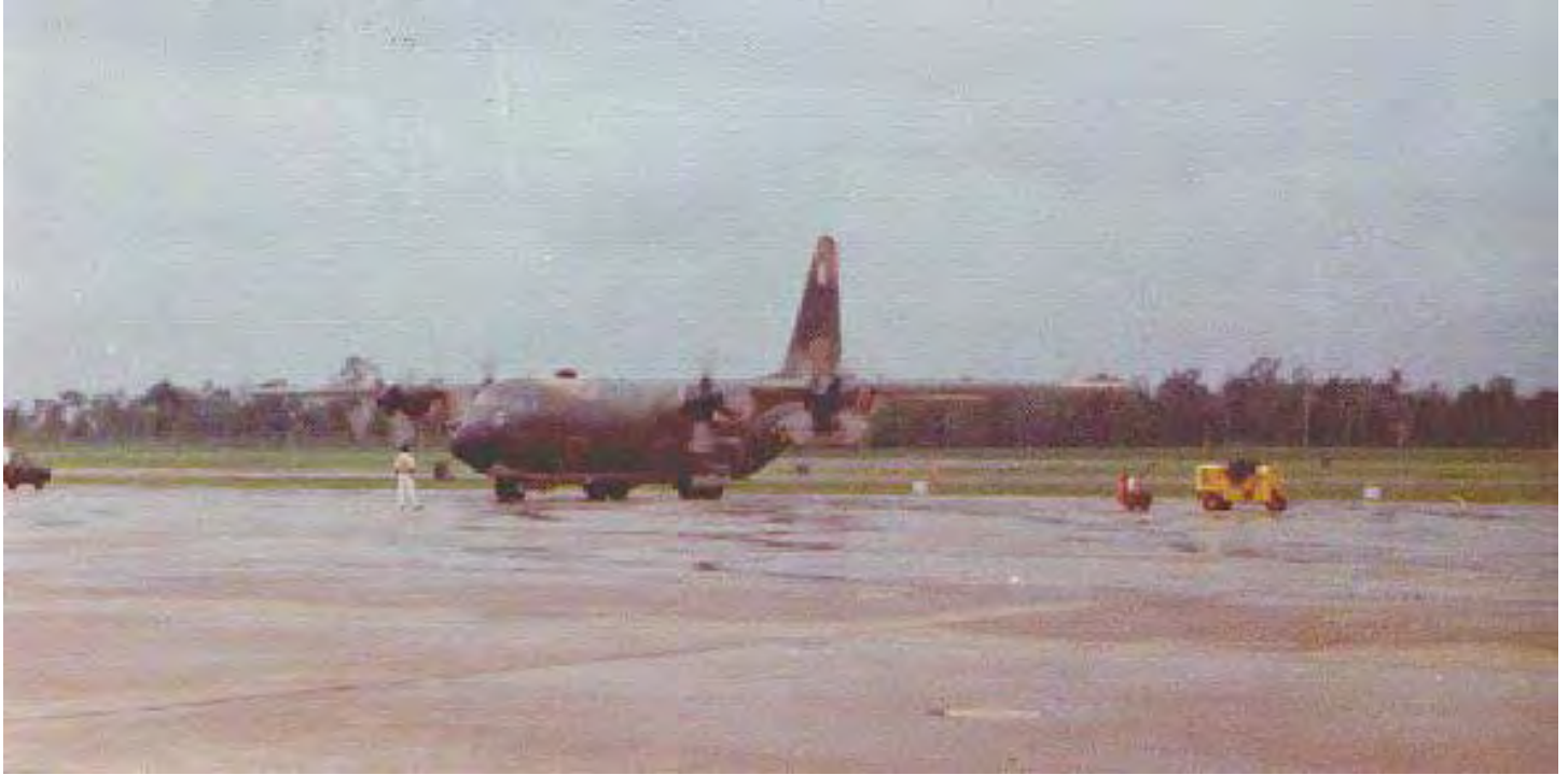
1. NKP: C-130 on flight line.