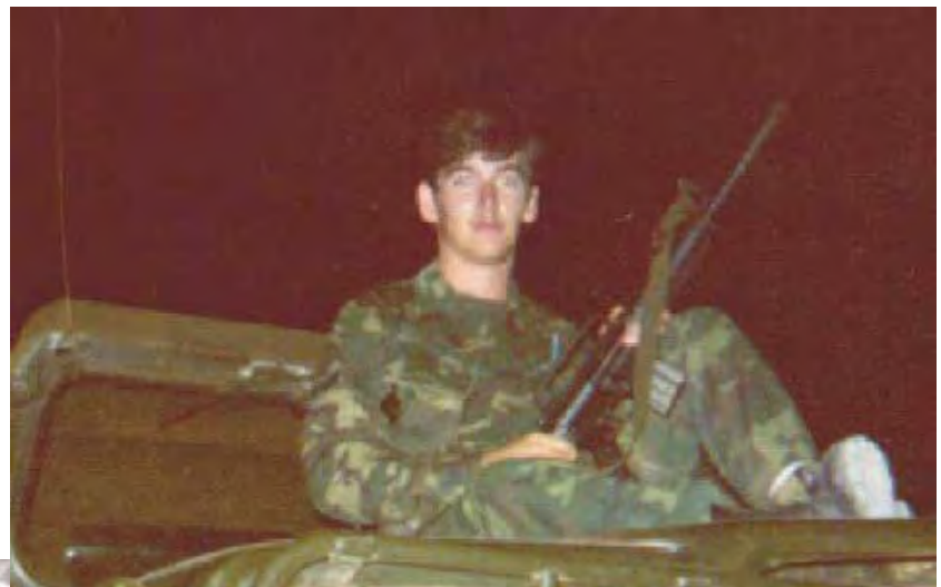
40. ... give me a minute to think, Sarge.