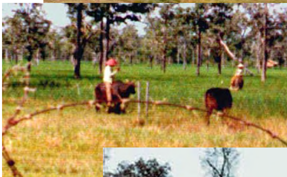
19. (left) Closeup of mamasan on her waterbuffalo. Mamasan and daughter-san tending rice paddy outside the perimeter. Daylight hours were okay to farm -- nighttime-- the paddy was a free-fire zone.