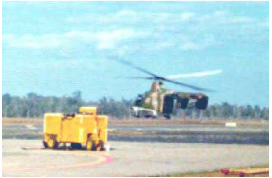
6-7. (above & below) HH-43 Closeup