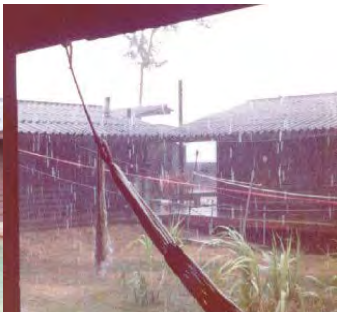
45. Now you can see why the hooches are up off the ground-- Monsoon rains!