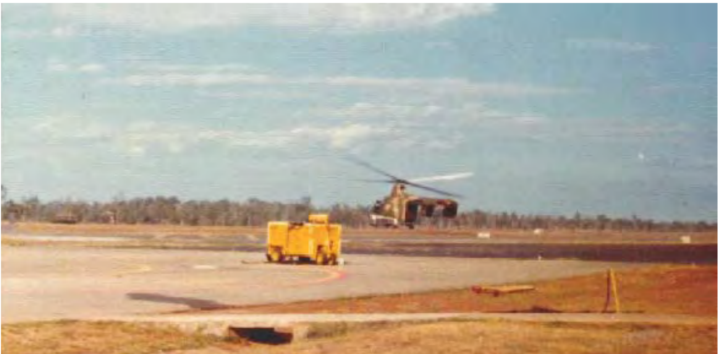
2. HH-43 "Huskie" Search & Rescue helicopter.