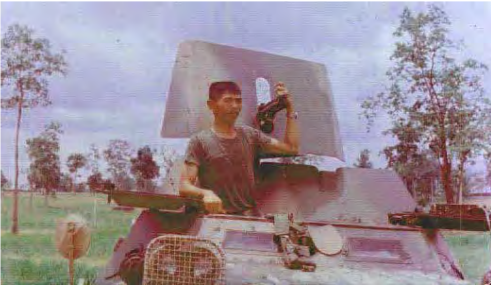
24. Thai guard on 206.