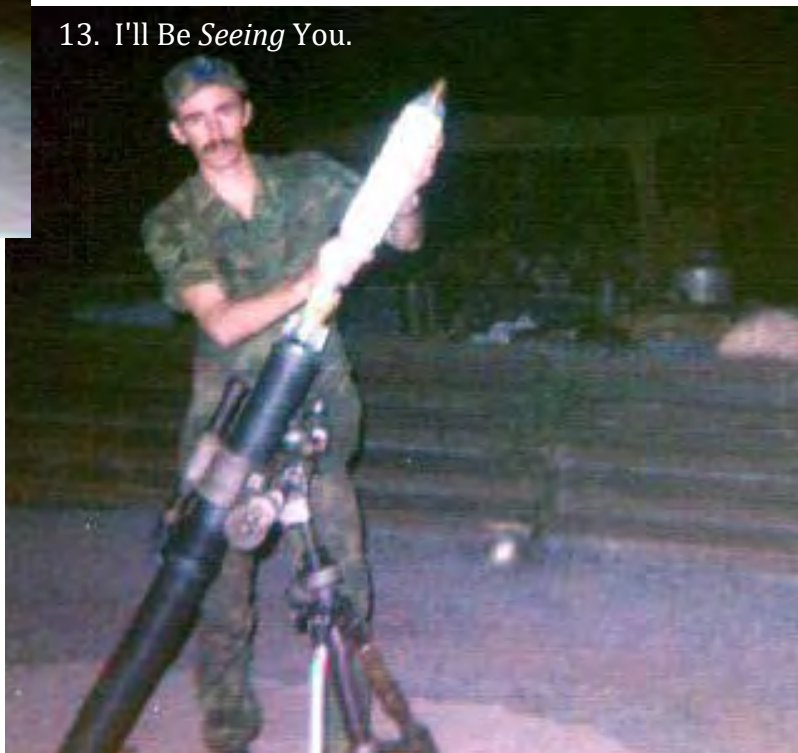
13. I'll Be Seeing You.