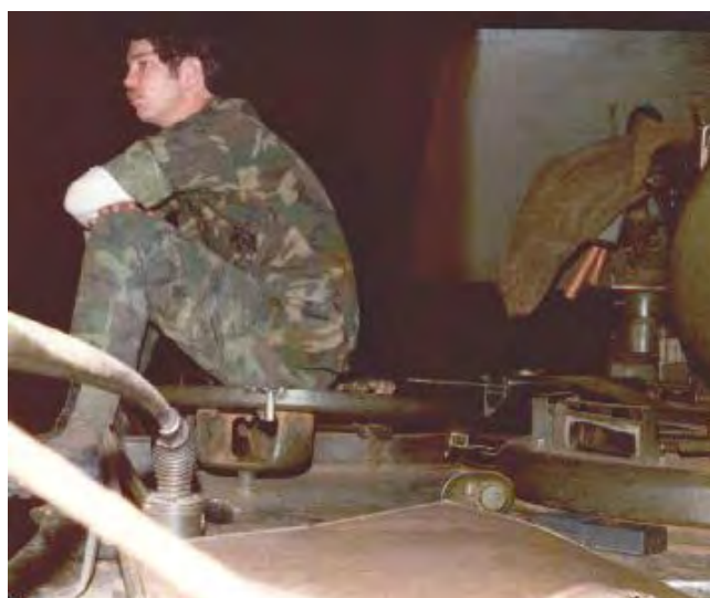
29. Chillin' on a trak. Hurry up... and... wait.