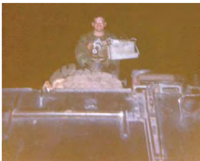
32. Manning the .50 cal on M-113 trak "Iron Butterfly".