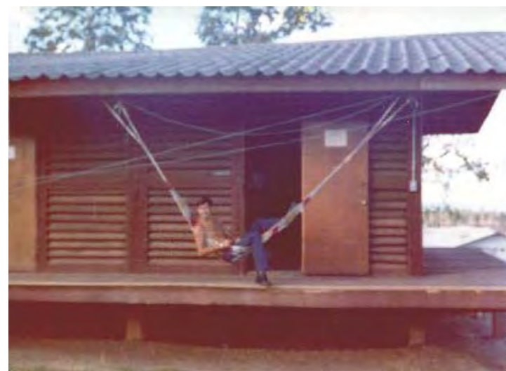
46. Takin' it Easy in front of the hooch.