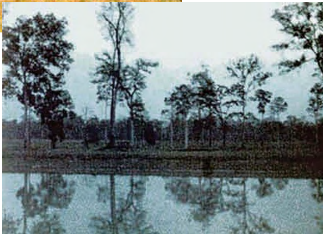
20. (below) Dawn, on the East perimeter... and yes, it was beautiful.