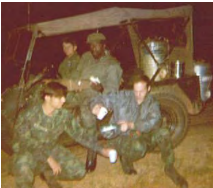
38. Midnight Shift Coffee rounds. If you could drink it, you were guaranteed to stay awake!