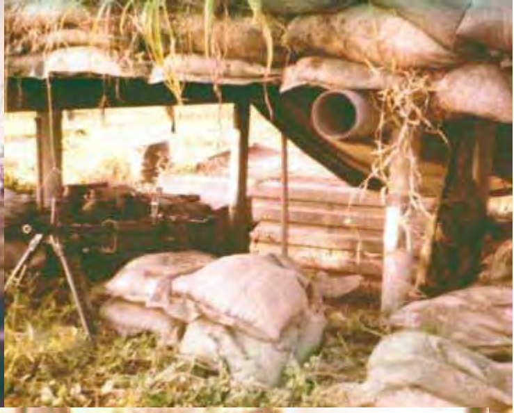
14. (above) View from M60 bunker, with Grenade-screen in front. Fields of fire. Waiting for the Dark.