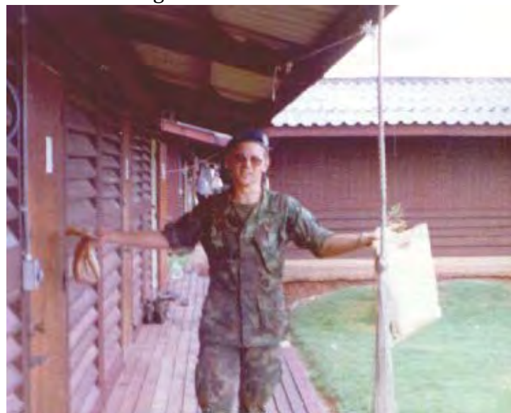
44. Home Sweet Home. Mr. Cool.