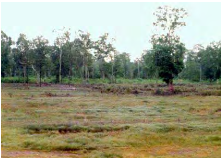
18. View of perimeter. Very spookie at night!