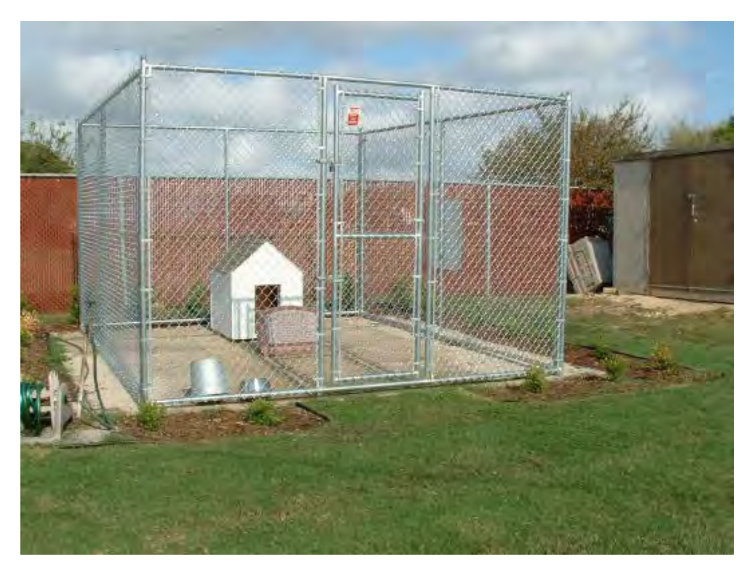
NEMO A534 new growl pad at Lackland AFB, Texas

The new NEMO growl pad was dedicated November 15, 2005. If you look inside the fence you will notice the monument that belongs to NEMO. (Additional information below)