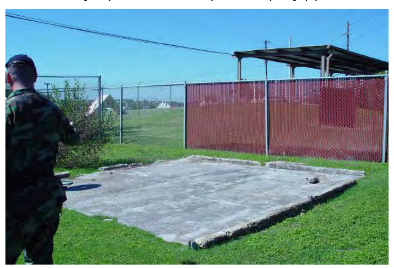
NEMO A534 old growl pad at Lackland AFB, Texas

The Nemo's War Dog Heros Association was formed and took it upon themselves to find Nemo's old growl pad at Lackland AFB, TX. (See the below photograph)