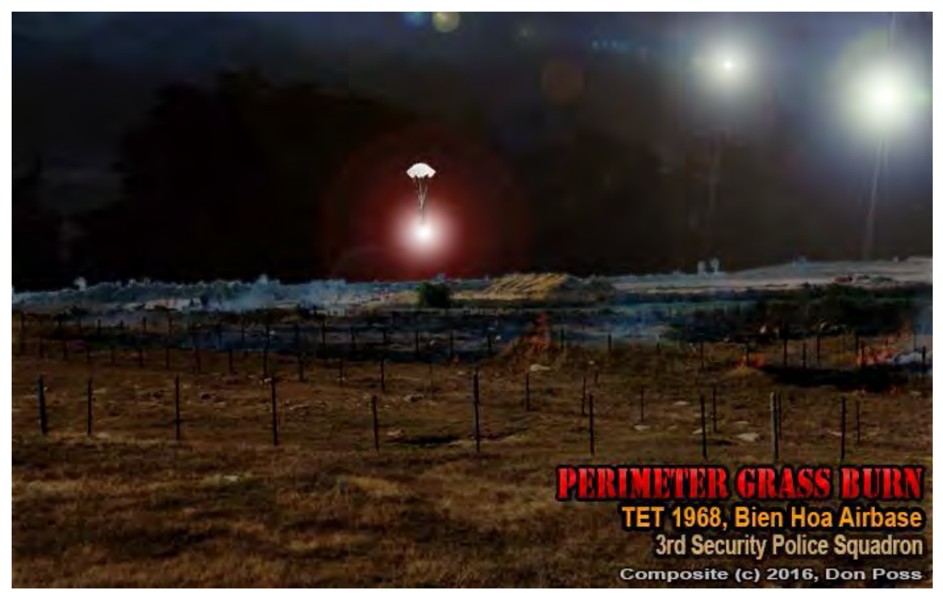
Biên Hòa AB: Perimeter grass fire. Tết 31 Jan 1968.