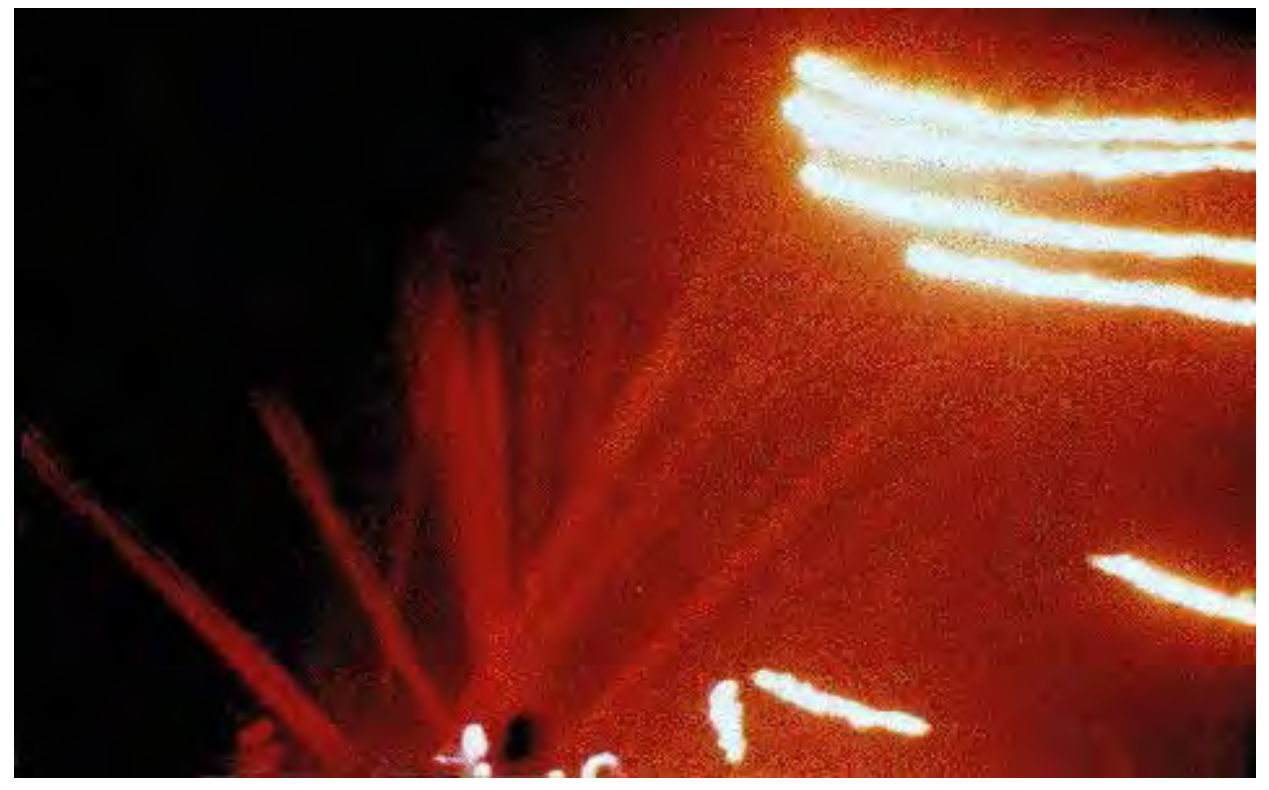
Biên Hòa AB, Rocket Attack, Tết 31 January 1968. Note Tower, bottom center.

My first thought was, "What the hell was that?"