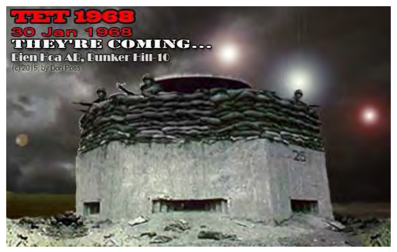
Biên Hòa Air Base, Bunker Hill-10, Tet, 30-31 Jan 1968: They're Coming!