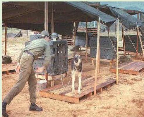
Photo Above: The first temporary kennels. The dogs were staked to their shipping crates using chains & collars. Wood pallets were used to raise the dogs above the mud during monsoon.

After the officer left I approached the fence between us and asked why. The Marine informed me that they were not allowed to chamber a round until fired on. Remember this was July 1965 and it wasn't long before they got rid of that silly reg. After a while our dogs adjusted to this type of activity.